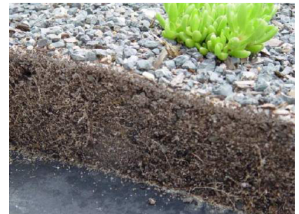
Example of a vegetated “green” roof cross section

Best Management Practice (BMP) is a term used in the United States and Canada to describe a type of water pollution control.