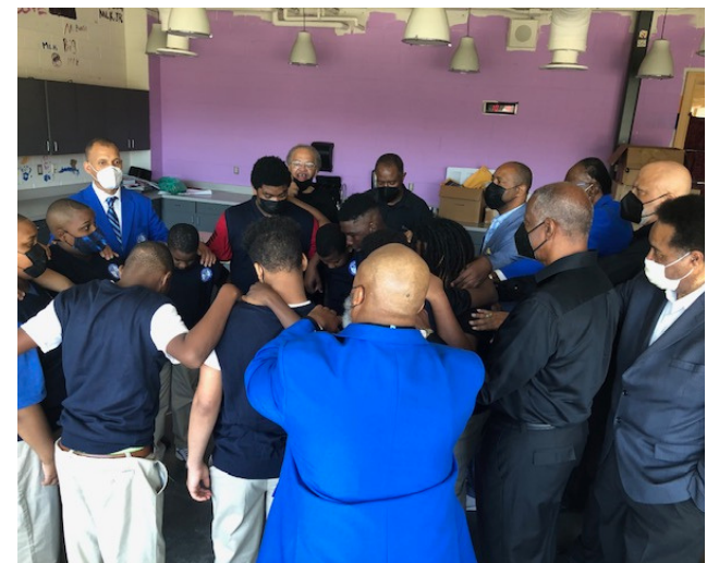
The Young Kings are receiving a word of encouragement as they experience their final commission.

OCWB staff participated in the Young Kings In Action Induction ceremony on May 19, 2022 at Martin Luther King Jr. Middle School to celebrate the completion of their ten-month program.