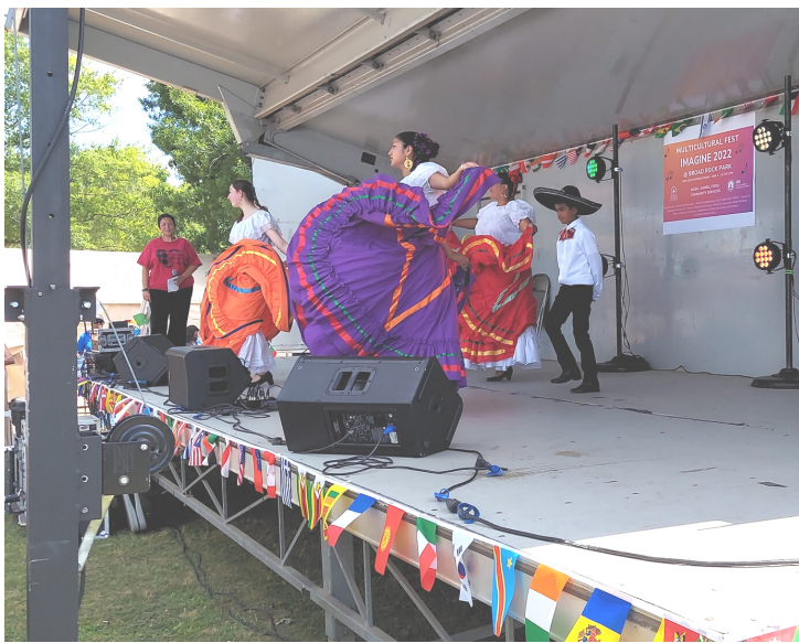
Salsa Guy Richmond Dance Team performs.

On June 4, 2022, OCWB participated in the Imagine Festival at the Broad Street Complex, which is the annual celebration of diversity and multiculturalism; RVA residents were able to experience performances, food, culturally inclusive games and more. This event is organized by the City of Richmond's Office of Immigrant and Refugee Engagement.