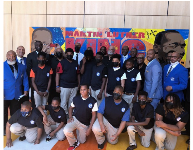
Young Kings in Action on Induction Day.