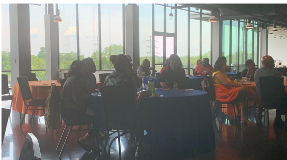
Audience of community partners and OCWB staff.