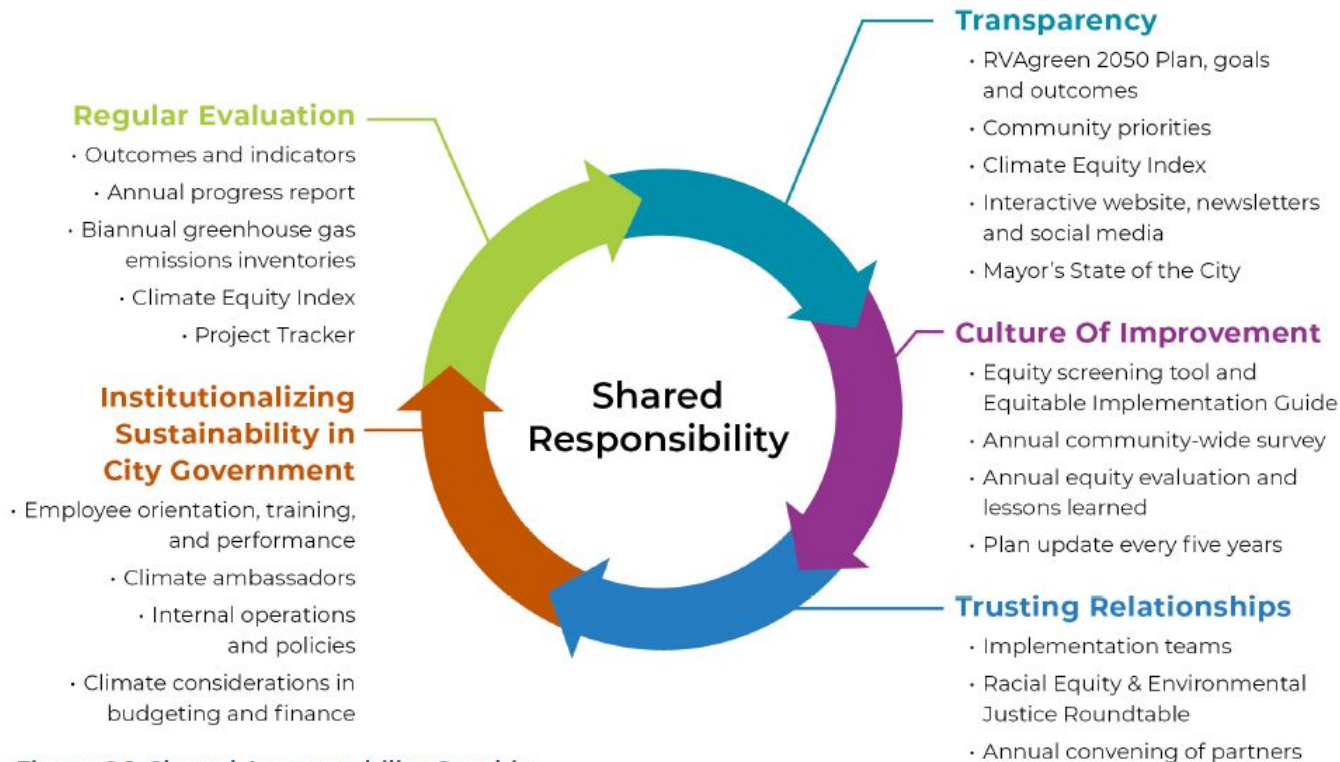
Figure 8.1. Shared Accountability Graphic