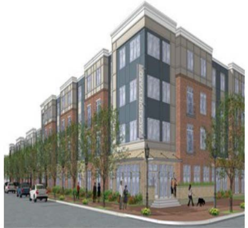
CPDC Jackson Ward

Jan 22 May 8 & 22 Jun 17 Jul 22 Sept 16 Dec 16