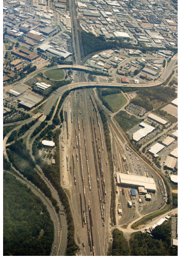
CSX Acca Yard

The city also contains numerous other freight and intermodal facilities in the form of rail storage yards and designated truck highway routes in the federal freight highway network. CSX maintains Fulton and Acca Yards, while Norfolk Southern operates a small rail yard just south across the James River from Downtown Richmond. The federally designated truck routes predominately consist of the interstates and highways along with other strategic routes needed to facilitate the movement in freight. All interstate interchanges in the city are with roadways that are federally designated truck routes. Conversely, the city and VDOT have restricted truck traffic on numerous city streets. Streets with prohibited truck access primarily consist of residential streets west of I-195, in Richmond's Northside to the east and west of Chamberlayne Avenue, and a few residential streets in close proximity to industrial areas. Trucks are also prohibited on Monument Avenue due to its historic significance.