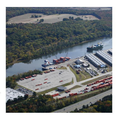
Port of Richmond

The Port of Richmond serves as an intermodal freight facility capable of transferring cargo containers across various modes of transportation. Its prime location along CSX rail and I-95 provide the port with direct access to the Northeastern and Midwestern markets of the country. Based on the Port of Richmond's 2008 Annual Report, the amount of tonnage passing through the port has steadily increased over recent years with 483,499 tons of cargo passing through the Port in 2008. The recent recession, however, has resulted in a substantial decline in activity with the loss of port calls from two major international shippers. While the port remains a key economic engine for the City of Richmond and the region, the port is still hindered by limited dock space, a small turning basin, the limitation of drafts to 22 feet, and limited land for expansion due to its physical location between the James River, I-95 and CSX railroad. To address some of these problems, the City has agreed to lease the port to the Virginia Port Authority with the hope of improving freight movement through the port by tying the port closer to the Port of Hampton Roads.