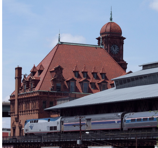
Figure 12: Multimodal Facilities