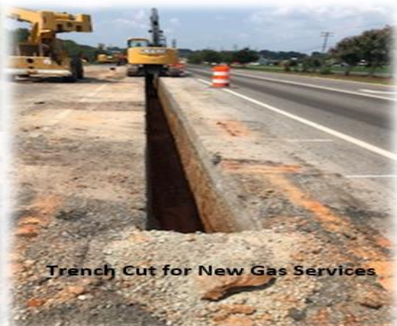
Trench Cut for New Gas Services