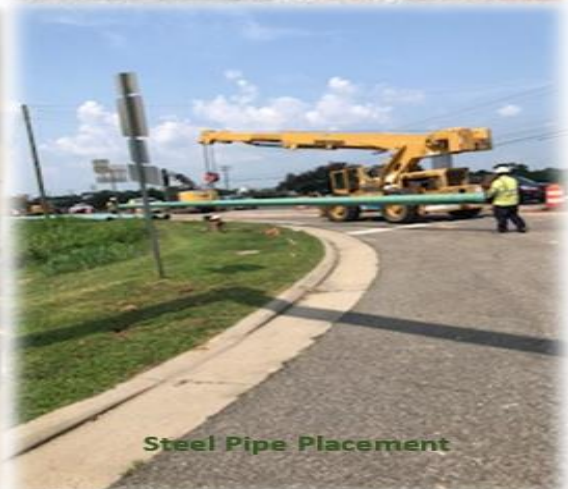
Steel Pipe Placement