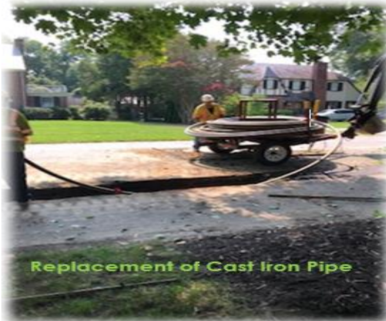
Replacement of Cast Iron Pipe

City of Richmond, VA City Auditor's Office November 7, 2018