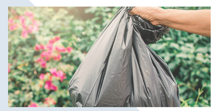
Requests for trash violations or issues can be submitted via RVA311.com or the RVA311 app.