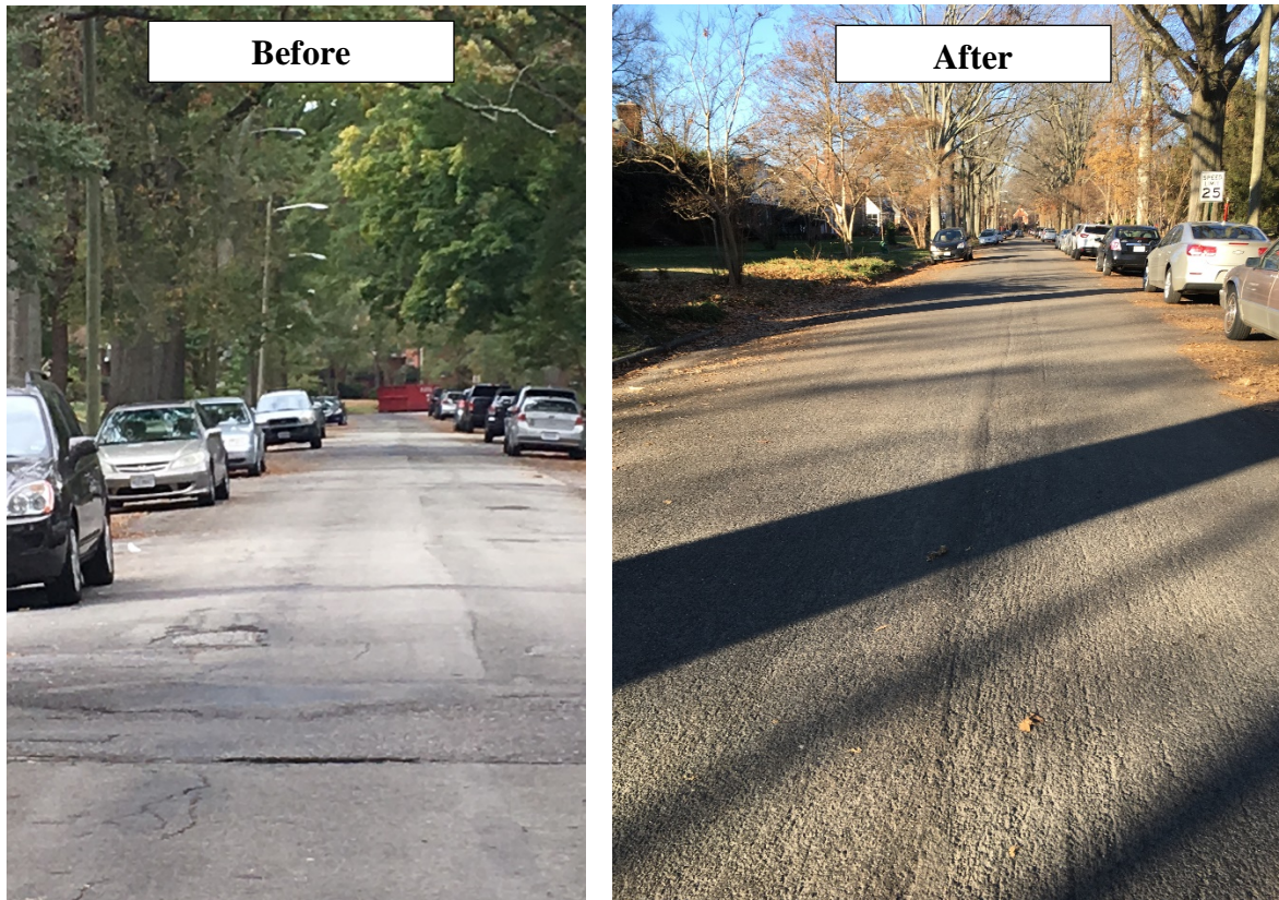
Whitby Road from Brook Road to Lamont Street

Below are photos of roads before and after treatment.