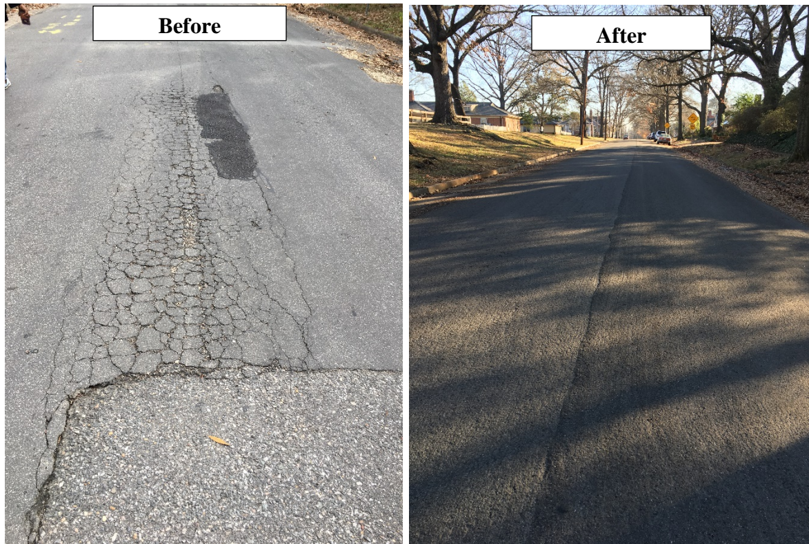
Rennie Avenue from Loxley Road to Brook Road

The City entered into a contract in March 2018 to conduct the heat scarification work for a maximum contract amount of $1,285,570. The contract included: