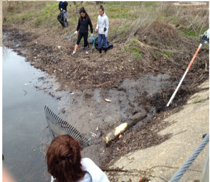
Upham Brook clean up in Bryan Park April 30, 2016