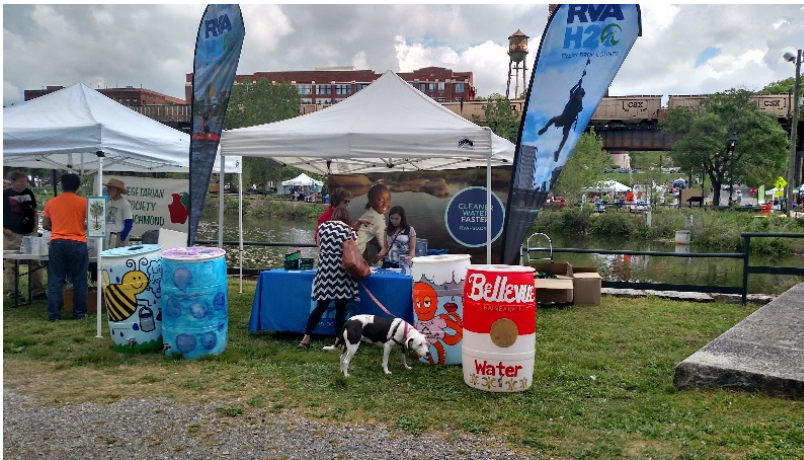
Colorful rain barrels at the April 2016 Earth Day Celebration

As evidence of our Public Participation effort, Stormwater Utility staff participated and/or planned the following activities held during the reporting period: