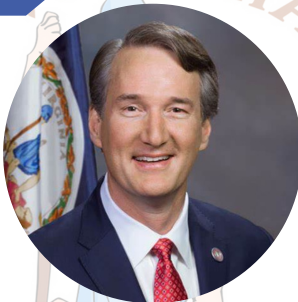
Glenn Youngkin Governor

Term of Office: 4 years Next Election: November 4th, 2025