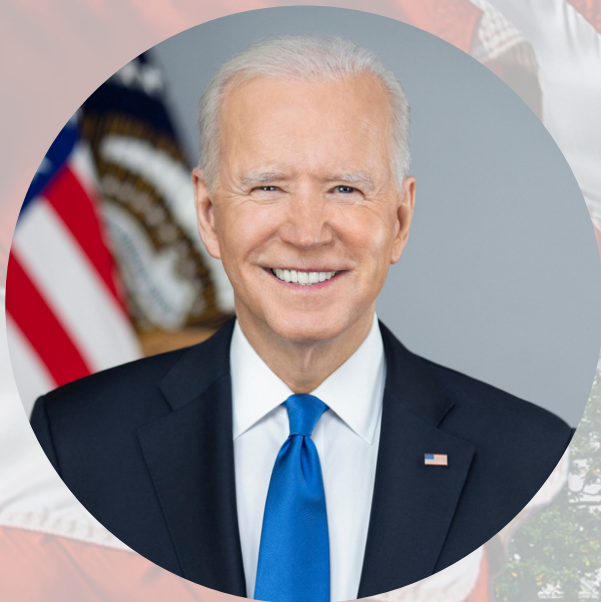
Joseph R. Biden President

Term of Office: 4 Years Next Election: November 5th, 2024