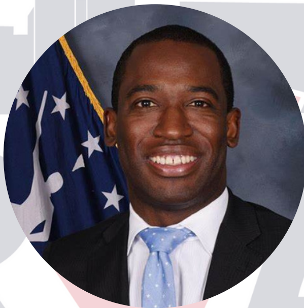
Levar Stoney Mayor

Term of Office: 4 years Next Election: November 5th, 2024