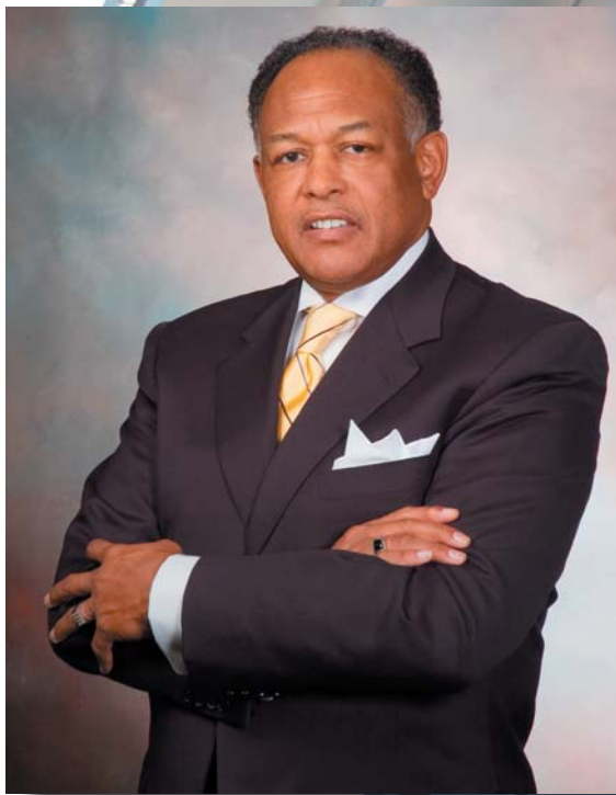
The Honorable DWIGHT C. JONES Mayor The City of Richmond, Virginia