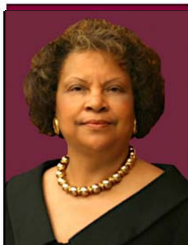
The Honorable Betty L. Squire East End 7th District Councilwoman